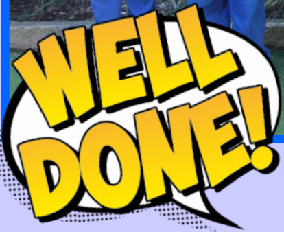
Sight Word Certificates